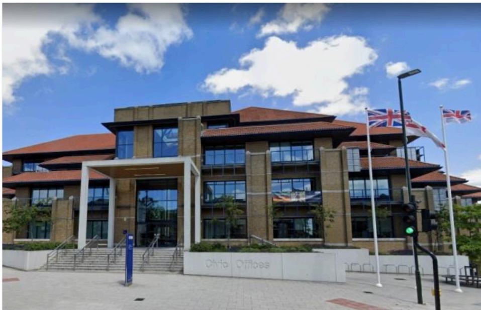
Bexley Council's wholly-owned development spin-off, BexleyCo, is likely to be hit by the coronavirus pandemic.

Local Democracy Reporter - Bexley, Bromley, Greenwich